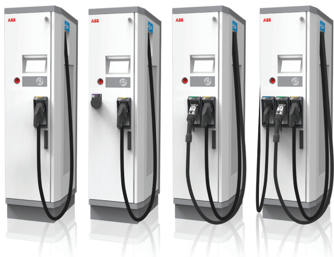
Possible configurations (from left to right): Terra 53 C, Terra 53 CT, Terra 53 CJ, Terra 53 CJG